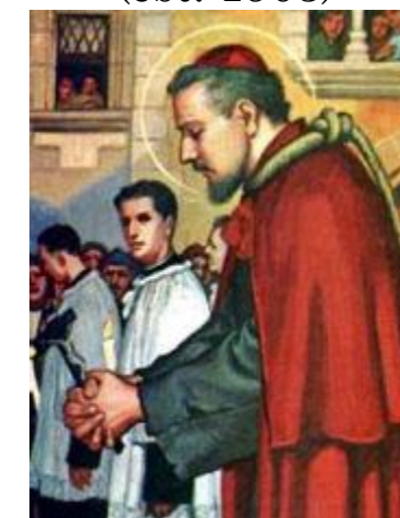
November 4 Patron of Seminarians and Catechists

Oh God, Maintain in your people that spirit with which you inspired your Bishop St. Charles, so that your church may be constantly renewed, conforming itself to Christ and manifesting Christ to the world.